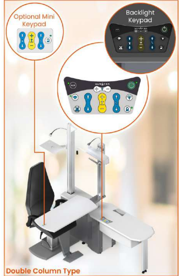
Double Column Type