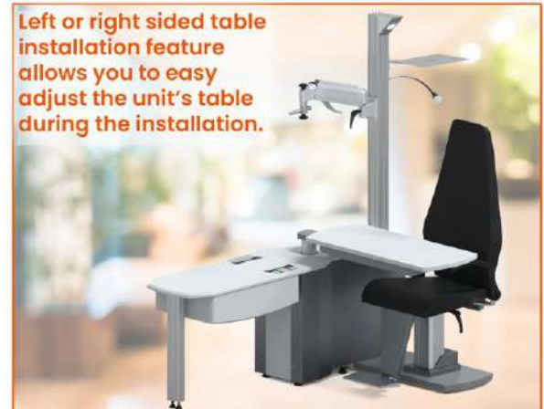
Left or right sided table installation feature allows you to easy adjust the unit's table during the installation.

IMPORTANT Yuratek Ltd. Şti. subject to change in design and / or specifications without advanced notice. For detailed info please contact your dealer.