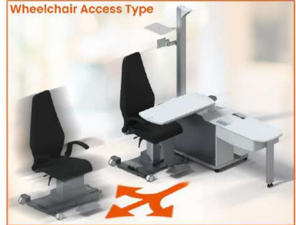
Wheelchair Access Type